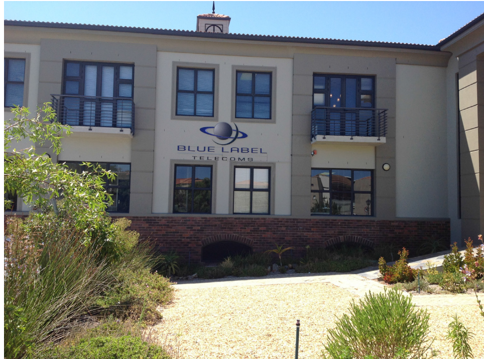
The Wirecard office is on the third floor of this building. February 4

In its 2013 annual report, Dale Capital reported: