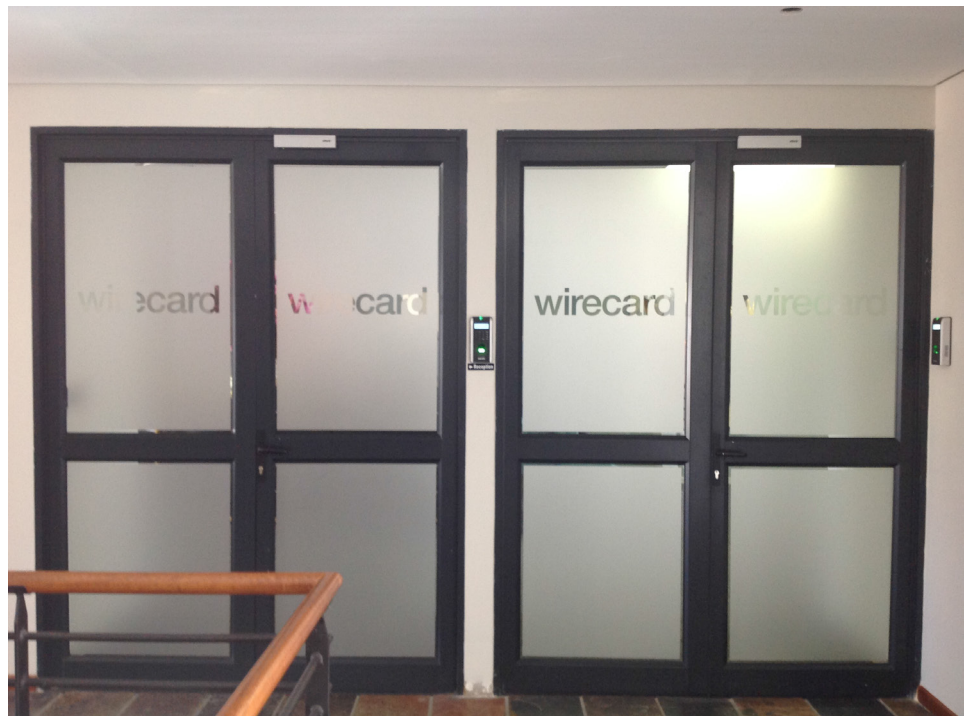
Offices of Wirecard South Africa, formerly Amara Technology Proprietary Ltd. The receptionist said that about 20 people work at the company.

Both acquisitions are small, low-value businesses. We remain convinced that Wirecard is overstating the amount of money that was paid for the companies and that it is making the acquisitions to create the illusion of a bigger balance sheet than it really has.