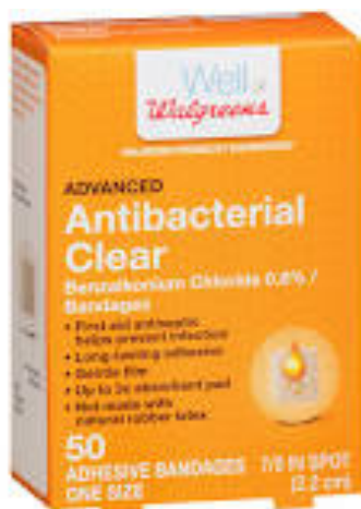
These bandages retail for USD 2.79.

been negatively affected by Actavis's September 2013 launch and Mylan's August 2015 launch of their lidocaine patch 5%, generic versions of LIDODERM® , and we anticipate that these revenues could decrease further should one or more additional generic versions launch," Endo warned in its 2017 10-K (page 19).