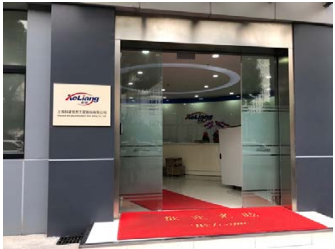
An unrelated company is operating at the reported address of Sorrento Shanghai.

Zova Biotherapeutics Inc. In 2014, Sorrento put RMB 27 mln, worth about $4 mln, into Zova Biotherapeutics for 30% of the company but never explained the purpose of the investment or provided the number to investors. This is another investment that has no obvious benefit for Sorrento and could benefit insiders who sit on the Zova board.