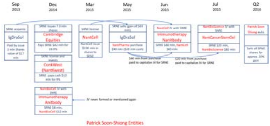
Chart 2. Nant Transactions 2013-16 (simplified)

having no ownership in NK. (13G/A, 2/1/2017)