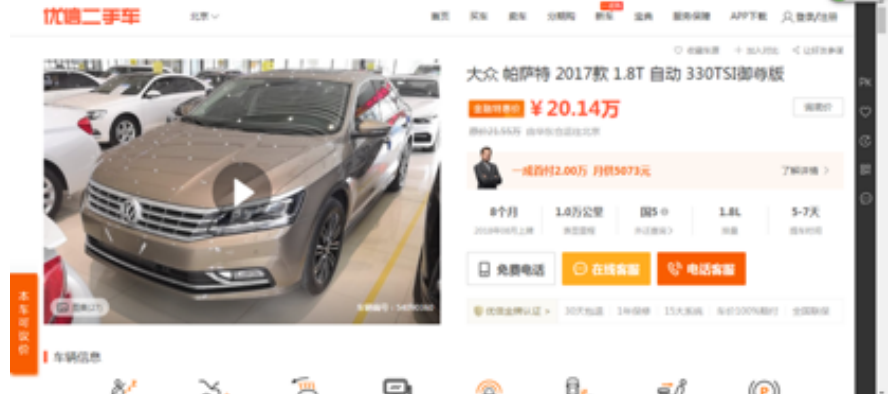
The Uxin listing