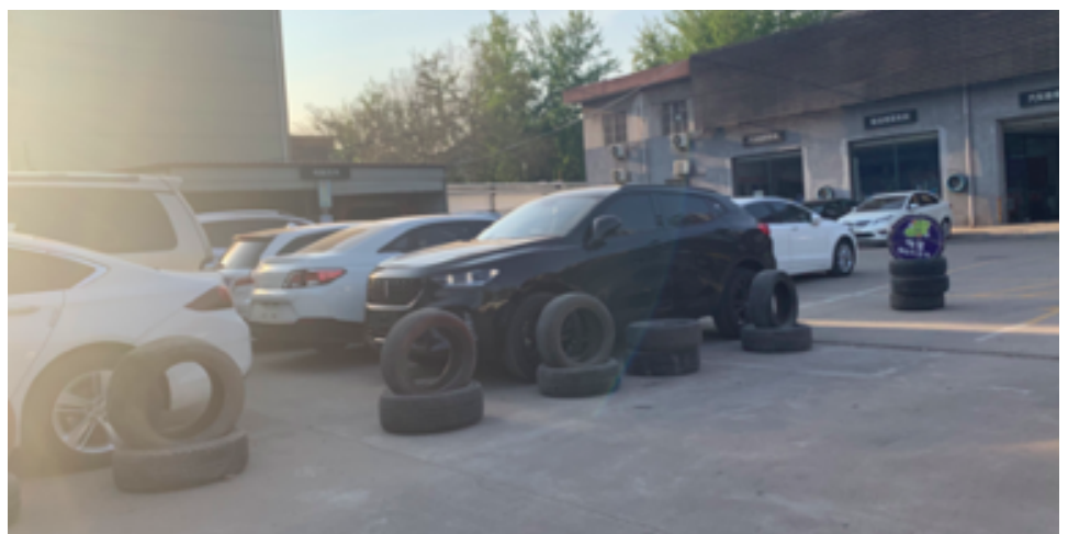
Left: Cars in Shijiazhuang likely owned by Uxin

We visited a Uxin lot in the city of Shijiazhuang and found about 15 cars that we believe had been purchased by Uxin because they had been issued temporary plates. When a customer buys a car, the original plates are can-