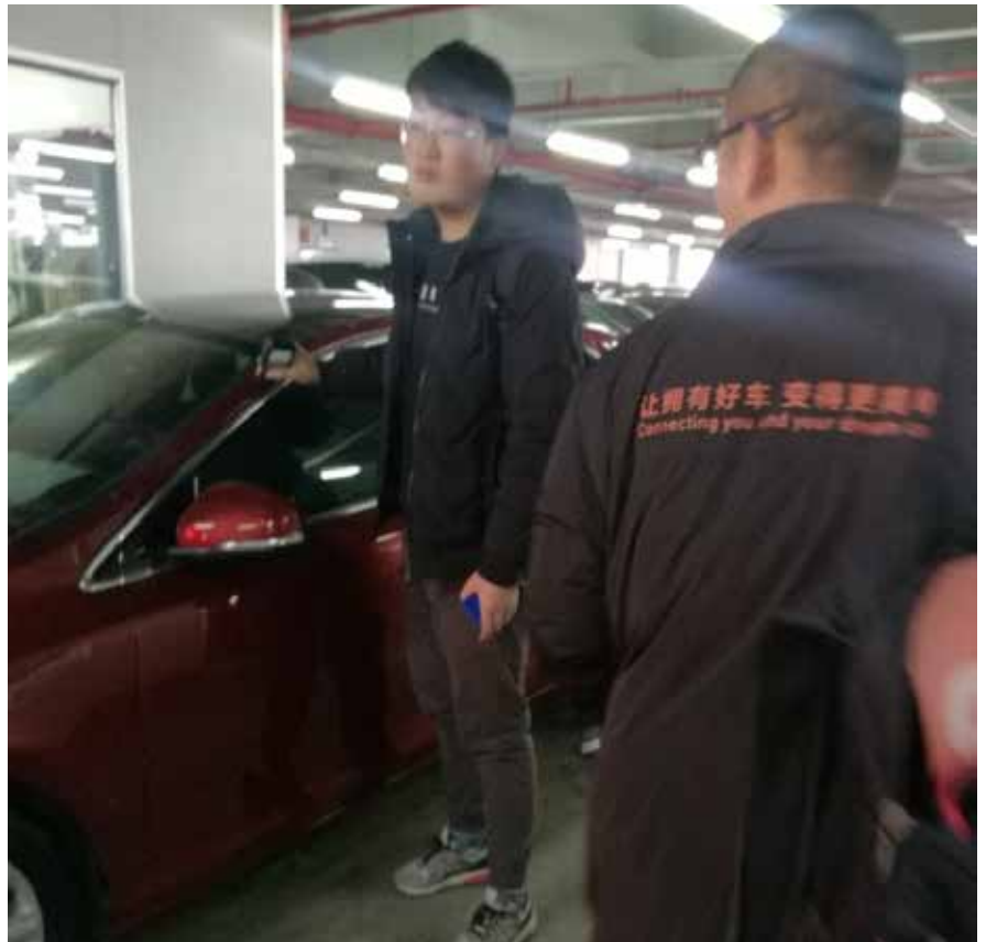
The employee pictured above on the right told us that this car is being offered on both Guazi and Uxin.