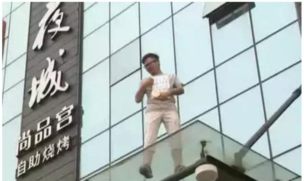
This man in Ningbo reportedly threatened to jump off a building unless Uxin returned his money. July 13, 2017