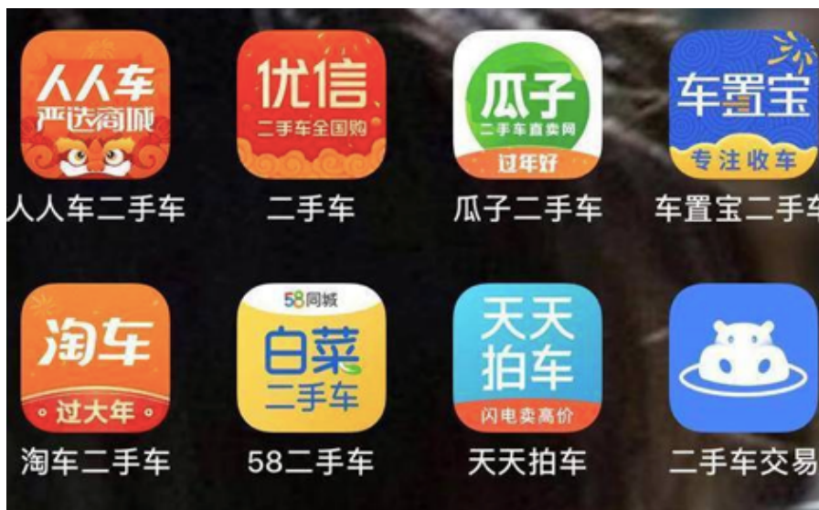
Major competitors in online sales of second-hand autos. From top left, Renren Che, Uxin, Guazi, Chezhibao, Taoche, 58.com, Tiantian Car Auction, and Second-hand Exchange.

Even in its reported financial statements—which omit huge liabilities--the company is in a perilous financial state. To try to persuade investors of its financial stability, in Q1 2019, Uxin basically relied on financial manipulation. It decreased current assets and increased current liabilities. It reduced its advances to sellers by 24% and almost doubled the proportion of advances it takes from buyers, to 33% of revenue from 17% of revenue. Uxin also sold a bit of equity. As it is, with ¥801 mln in the bank and burning ¥250-300 mln each quarter under the best of circumstances, the company will likely have to raise cash just to keep the lights on.