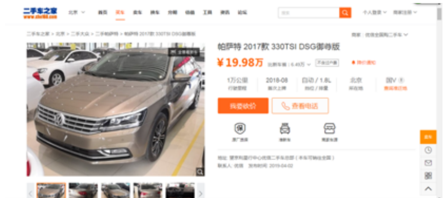
The Che168 listing