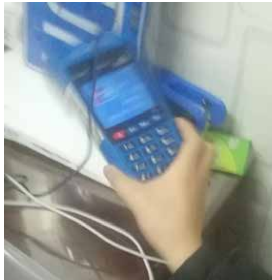
A photo of the Uxin POS machine at a second-hand dealer in Shanghai.

Our interviewees could not tell us how many Uxin POS machines are in the market, but a former finance manager for the company said “at least 5,000.”