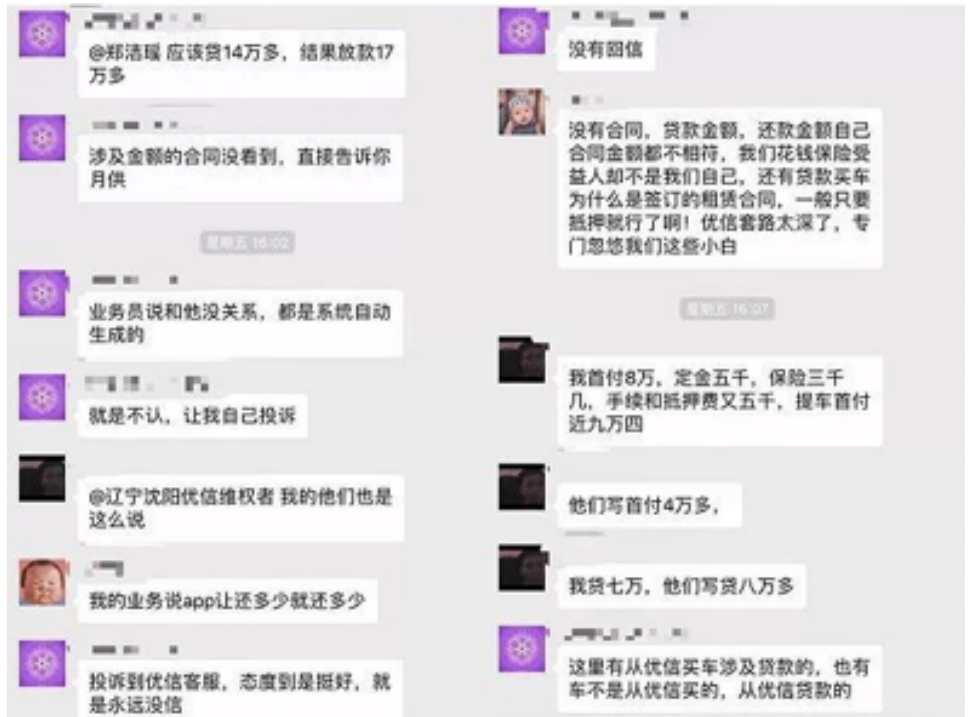
Chat record between Uxin buyer and attorney, published on Sohu November 12, 2018: http://www.sohu.com/a/274867767_168553

Similarly, “on November 9, 2018, I bought a car from Uxin Second Hand Auto,” says a blog post carried on a site called “Fast Lane Complaints.” The car cost ¥60,000 ($8,940), and Uxin assessed it at ¥160,000 ($23,841) and