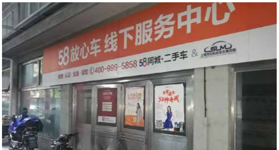
Service locations in Shanghai for Uxin (top), Guazi (middle) and 58.com (bottom).