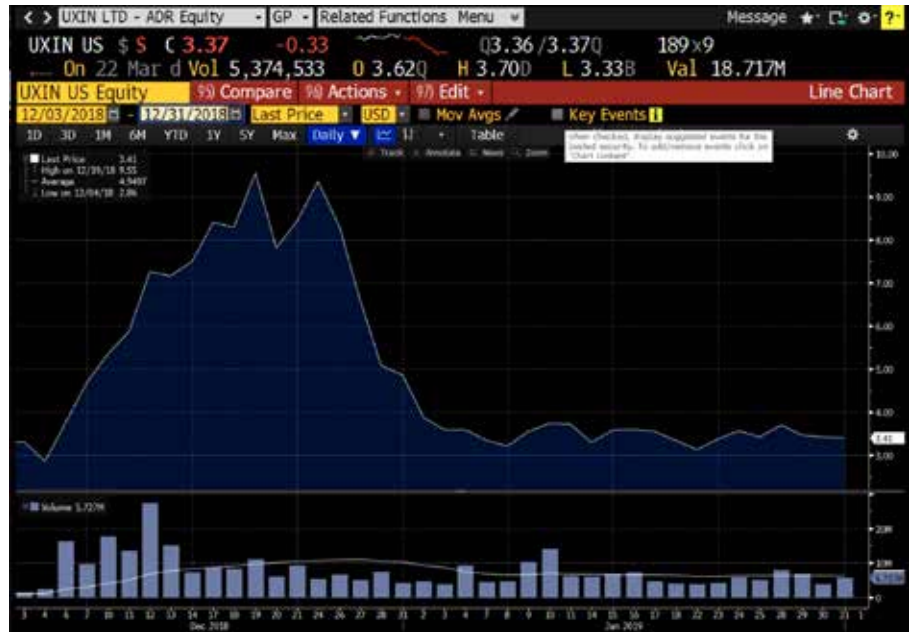
Chart 3. Uxin Stock Price (USD top) Volume (mlns), December 2018