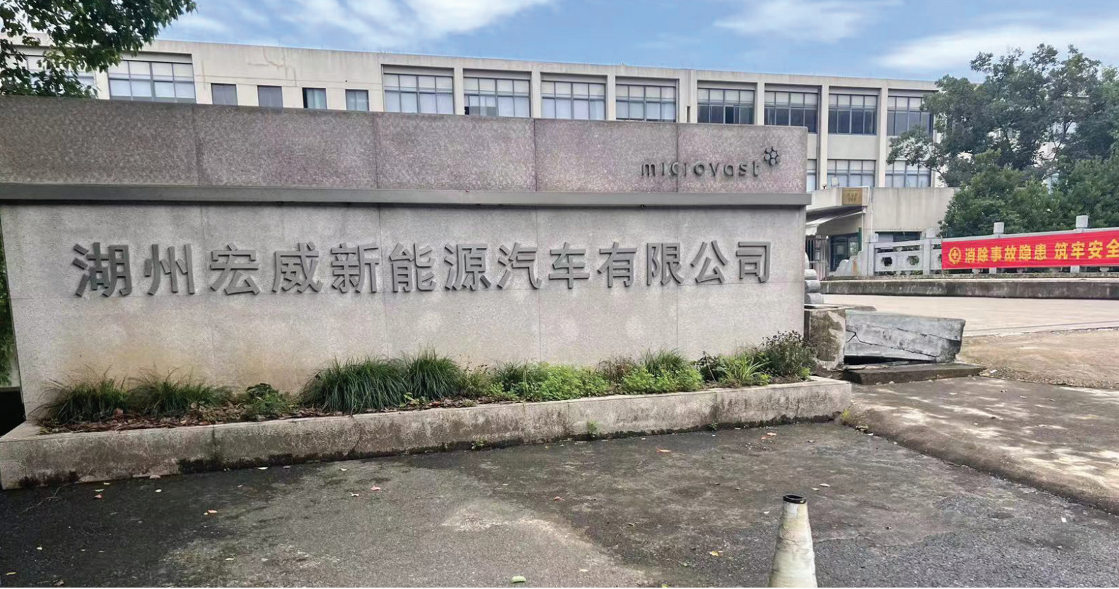
Our photos of the three sites in China show no construction activity and no visible manufacturing.