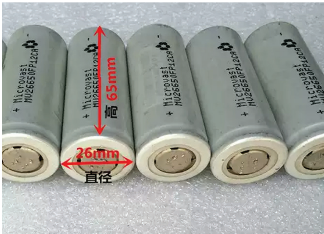
Photo of MVST lithium iron phosphate batteries for sale for ¥3 each on Taobao. Screen capture October 17, 2023: https://www.taobao.com/list/item/563221534068.htm?spm=a21wu.10013406.taglist-content.19.1e1b7142oqSMUz