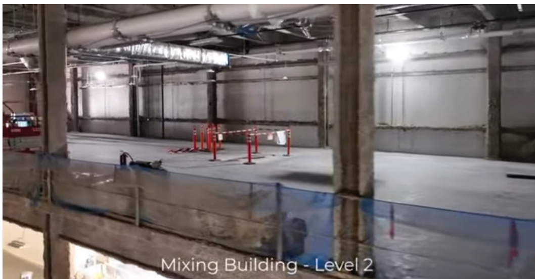
MVST channel on Youtube, June 2023 https://www.youtube.com/watch?v=SYpC320bHUM

MVST has assured Clarksville that it is continuing to expand its first plant, even though plant 2 has been mothballed. But the video MVST has posted to demonstrate progress does not fill investors with confidence: nothing was inside the building as of last June 2023. Yet in the Q2 2023 10Q, the company reported it already had $241 mln worth of property, plant, and equipment in the United States..