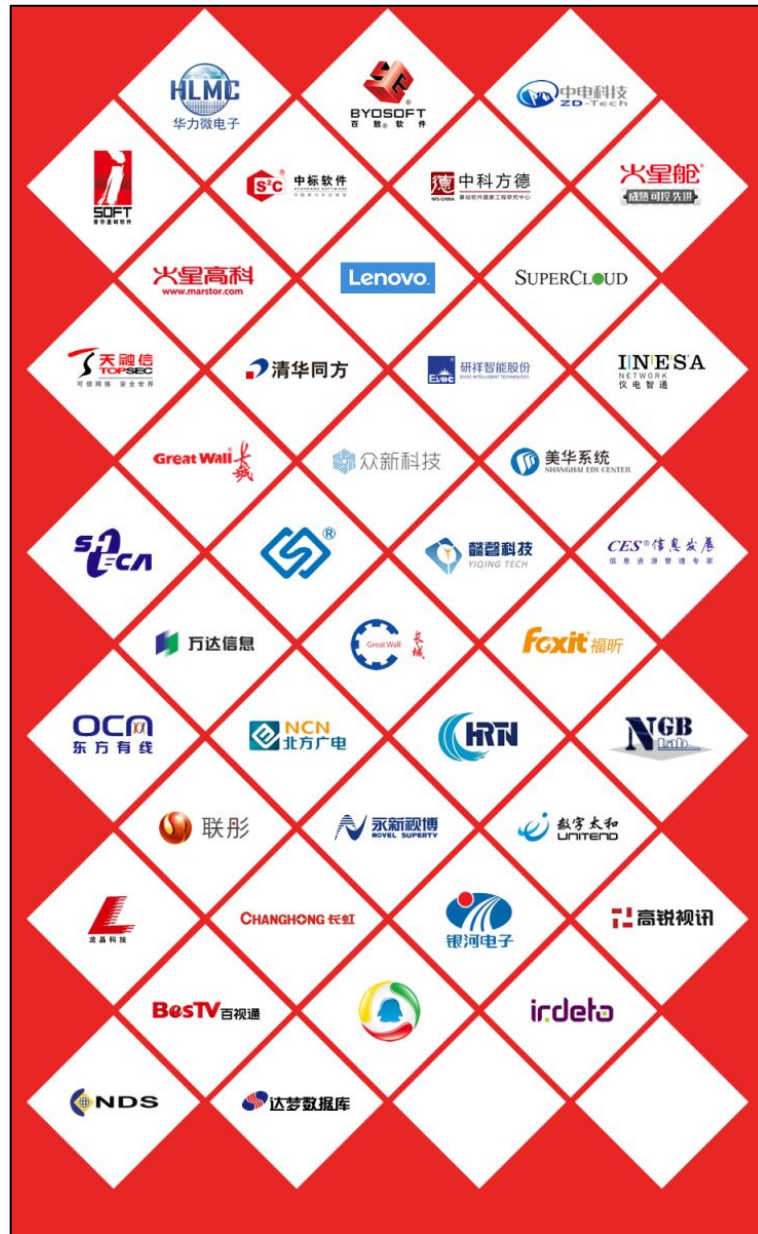
Figure 3: Shanghai Zhaoxin Partners

companies, notably Tsinghua Tongfang (清华同方), are immediately recognizable as suppliers to the People’s Liberation Army and China’s military-industrial complex.