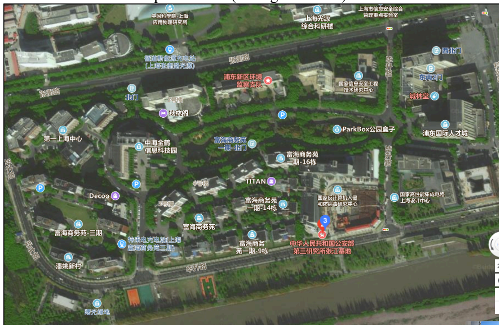
Figure 2: Screenshot of Baidu Maps search results. The blue pin (3) marks the MPS 3rd RI building. Shanghai High-Performance IC Design Center is to the right, and National Information Security Engineering Technology Center is above ParkBox.

MPS 3rd RI appears to be co-located with PLA Unit 61398 (61398 部队), also known as the General Staff Department (GSD) Third Department, Second Bureau (总参三部二局). 99, 100 In addition, MPS 3rd RI's Zhangjiang base is directly next to the National Information Security Engineering Technology Center (国家信息安全工程技术研究中心), an entity known to be affiliated with the GSD Third Department 101 (see figure below).